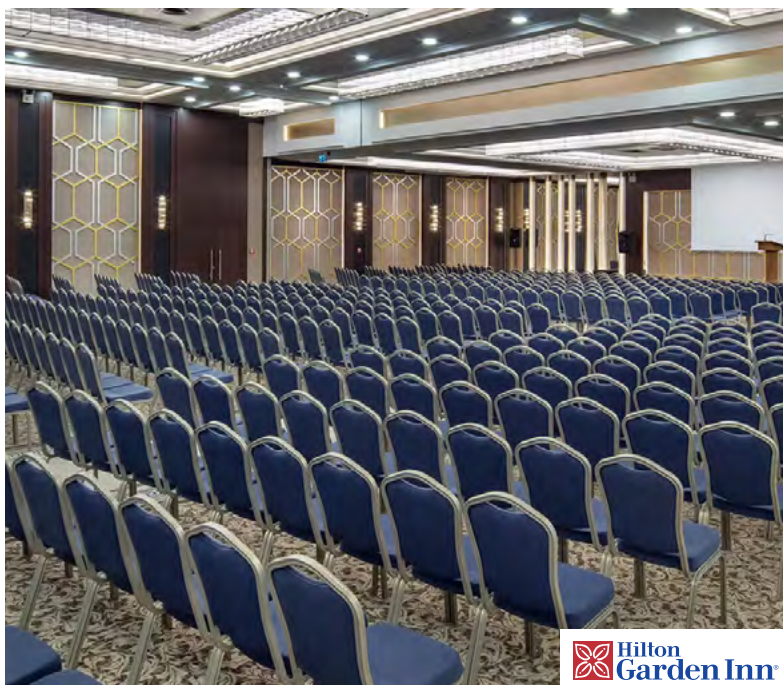
Hilton Garden Inn