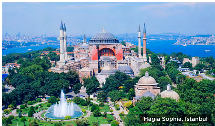
Hagia Sophia, Istanbul