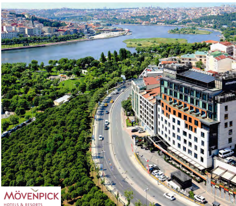
MÖVENPICK HOTELS & RESORTS