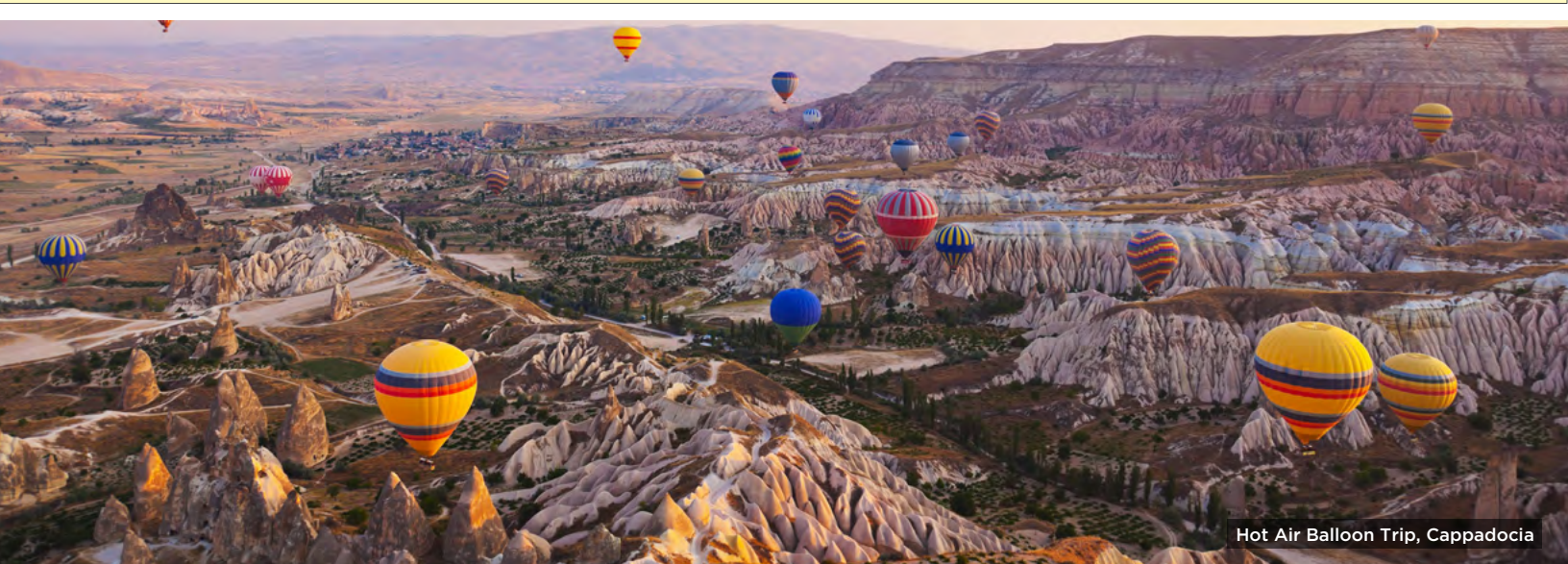
Hot Air Balloon Trip, Cappadocia