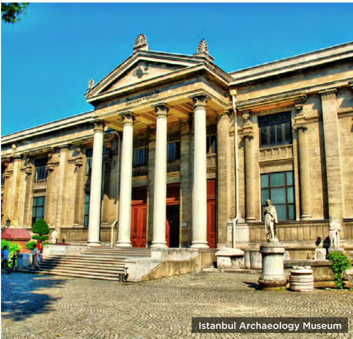
Istanbul Archaeology Museum