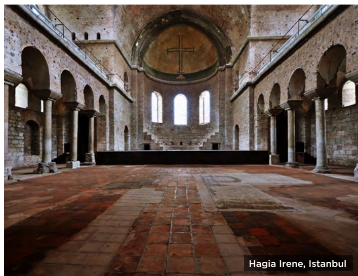
Hagia Irene, Istanbul

Afternoon private Bosphorus boat tour seeing both Asian and European shores of Istanbul. Dinner and overnight at the Moevenpick Golden Horn Hotel. (B,D)