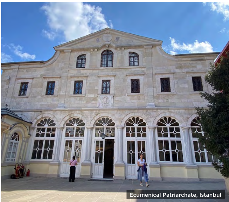
Ecumenical Patriarchate, Istanbul