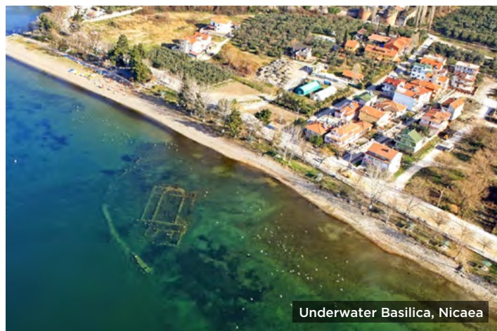
Underwater Basilica, Nicaea