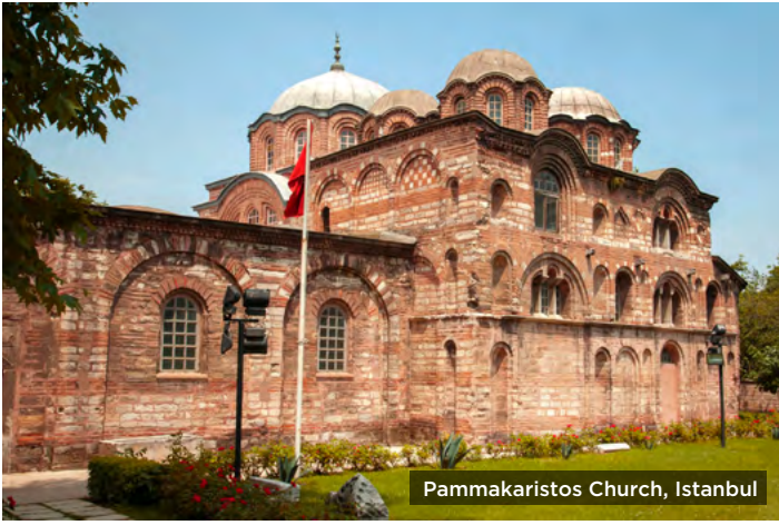
Pammakaristos Church, Istanbul