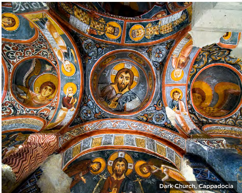
Dark Church, Cappadocia