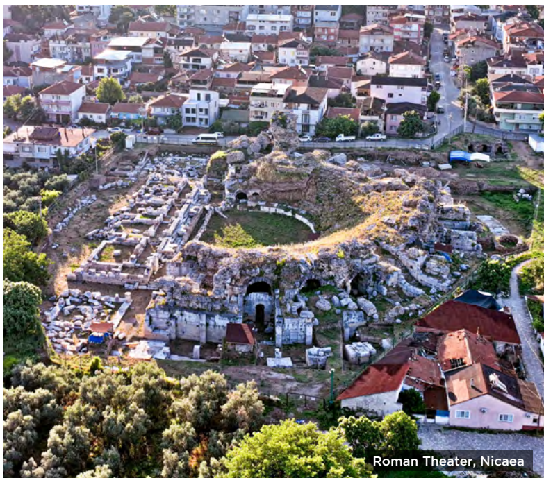
Roman Theater, Nicaea