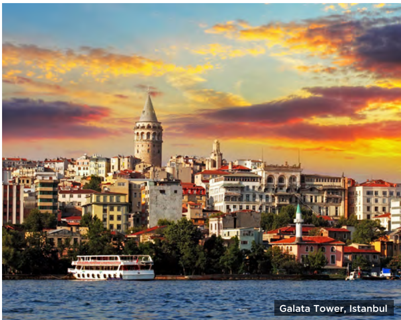
Galata Tower, Istanbul