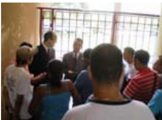
In La Universidad Javeriana, Cali, Colombia

Bangladesh, Belize, Bolivia, Ethiopia, Guyana, India, Kenya, Moldova, Nigeria, the Philippines, Russia, Uganda, Ukraine, and the U.S. (less wealthy Christians in the states and territories).