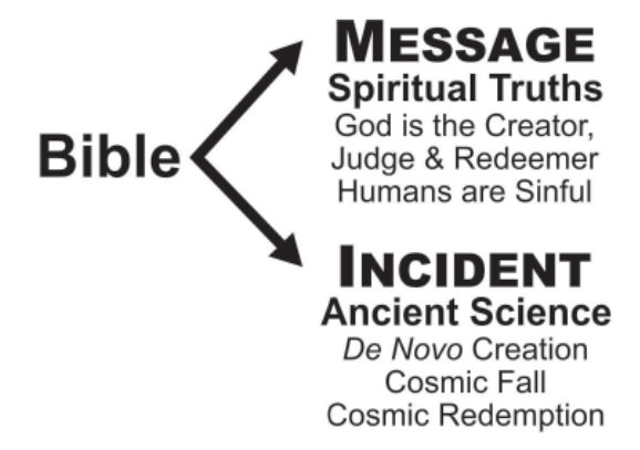
Figure 6. The Message-Incident Principle and a Non-Concordist Interpretation of the Bible's Creation-Fall-Redemption Metanarrative

To move beyond concordism and conflation, it is necessary to separate the incidental ancient science from the Holy Spirit's life-changing messages of faith. I term this hermeneutical approach the "Message-Incident Principle." In this way, the ancient paradigms of the physical world embedded in the Creation-Fall-Redemption metanarrative become vessels that deliver metaphysical or spiritual foundations of the Christian faith. A nonconcordist interpretation of this grand narrative in scripture redirects attention to the inerrant spiritual truths. Figure 6 presents the Message-Incident Principle and separates the spiritual messages associated with