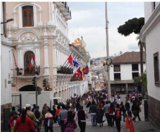
Old town Quito (Ecuador)

While I loved walking through old Quito, so rich with history (early 1500s), and sampling the local cuisine with friends here and in Colombia (Bogotá and Medellín), the real reason I'm in South America is to teach: to bring seekers to faith and to help believers continue to seek.