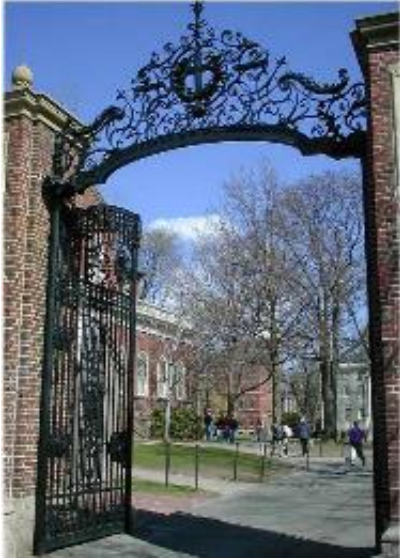
Harvard University (founded 1636)