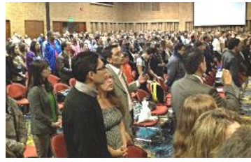
Sunday in Bogotá