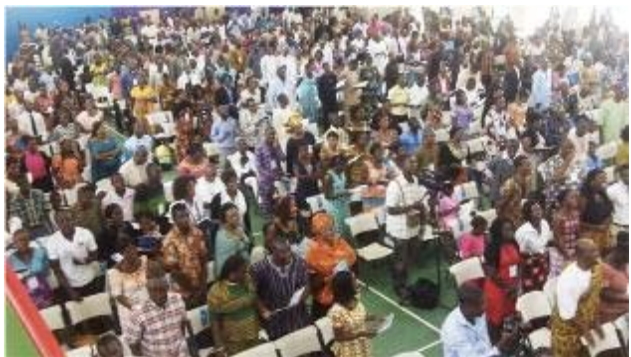
20th Anniversary Service, Accra Christian Church

The fellowship in Accra has several hundred members, and during our visit the church celebrated its twentieth anniversary. All of the church's former staff members, along with several visiting speakers from other nations, traveled to Accra for a special anniversary service. Accra also hosted the West African Leadership Conference (Nigeria, Sierra Leone, Liberia, Guinea-Bissau, and several other nations were represented).