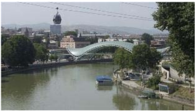
Kura River, Tbilisi

From there I traveled to Bazaleti, in the Republic of Georgia—my first visit to this nation and to the Caucasus region, which includes Georgia, Armenia, Azerbaijan, and parts of Russia. In Georgia I conducted four workshops at a Caucasian retreat, attended by disciples from Yerevan (the capital of Armenia), Tbilisi (the capital of Georgia), and Baku (the capital of Azerbaijan), plus Azeri Christians from Kakhi and Ganja. Because the nations of Armenia and Azerbaijan are embroiled in ongoing conflict, this retreat had to be conducted in Georgia, on neutral "turf." It brings me such joy and faith to see the way that God tears down barriers between natural enemies and makes them brothers.