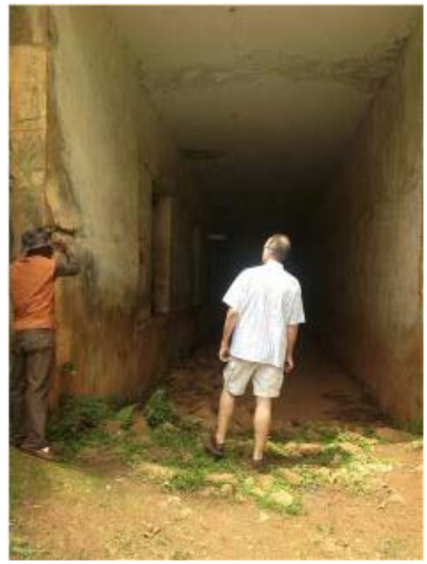
Idi Amin's torture chambers

On a more positive note, I also visited the Ugandan Parliament building, a historic place. I even spoke there (to an audience of two!—no politics here).